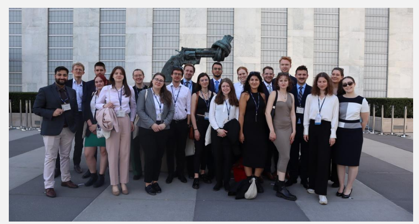
Giessen's delegation 2023 during their visit to the United Nations Headquarters in New York